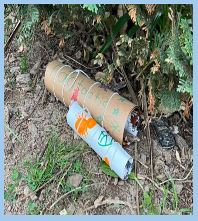
squares and rolled it up. We then wrapped the newspaper, twigs and leaves in the cardboard and secured it with string. Our next job is to find the perfect, shady spot to place our bug hotel.