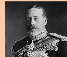
King George V

He was a British businessperson and a shipbuilder who was in charge of designing the Titanic. He was commissioned by White Star Line company to create a ship bigger and better ships than another shipping company.