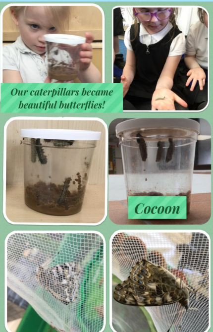
Our caterpillars became beautiful butterflies!

The children have been very excited in Reception, as we had our very own caterpillars. The caterpillars came to us at the beginning of term, and we have been closely observing the changes as they grow. First, we noticed the caterpillars were "tiny" and that "they wiggle like worms". The caterpillars were then "very hungry, just like in The Hungry Caterpillar story" and after a while we could see that they were forming cocoons around themselves. We learned that inside the cocoon, the caterpillar undergoes a metamorphosis, which is the scientific name for all the changes that happen to turn them into butterflies. Our butterflies hatched this week and we then waited for their wings to be dry for them to be set free. Goodbye beautiful butterflies!